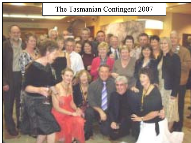
The Tasmanian Contingent 2007

The Teams dinner was held on Friday 14 September at the Rendezvous Observation City Hotel at Scarborough and we could walk to this one. The presentations were held first and then again it was time to party.